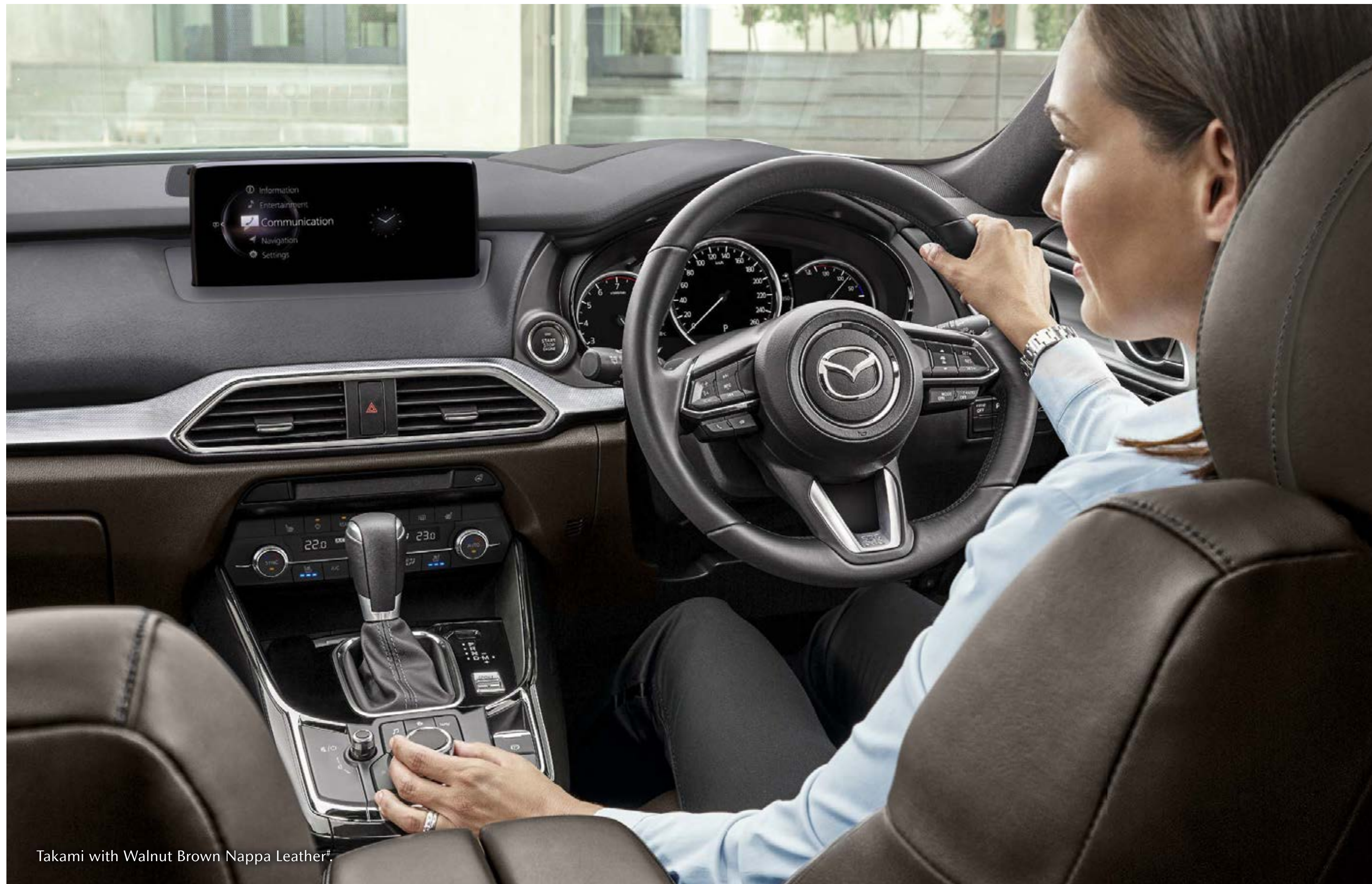
Takami with Walnut Brown Nappa Leather#.

On Limited and Takami grades, the Mazda Connect infotainment system is presented via a stunning 10.25-inch widescreen display, while both grades also offer the added convenience of wireless phone charging‡.