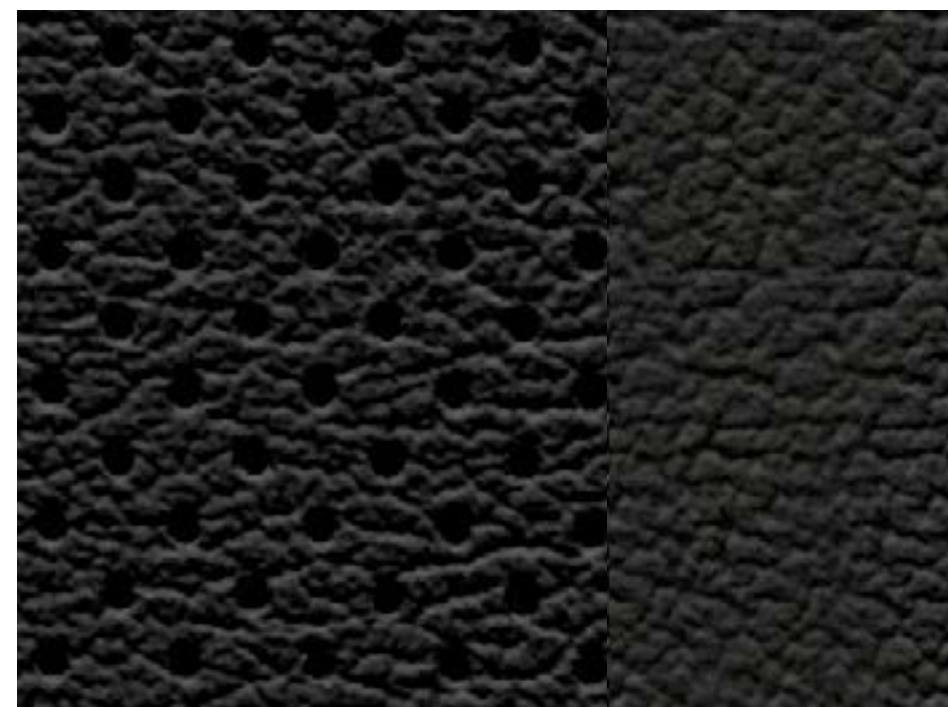
Black Leather# (GSX, Limited)