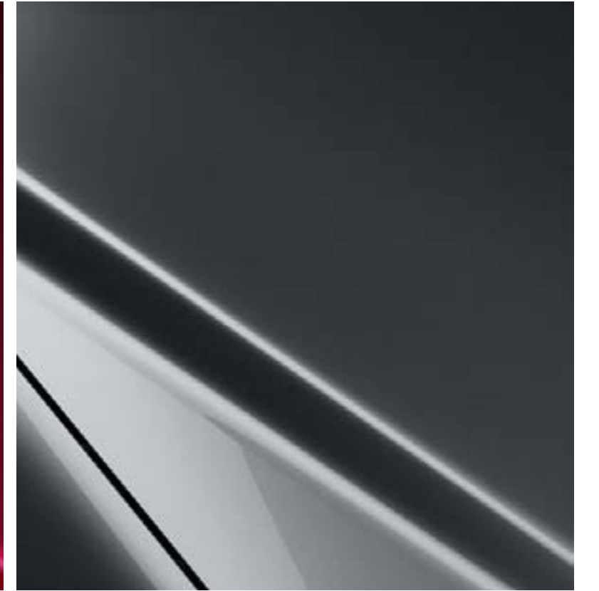
Machine Grey Metallic ^