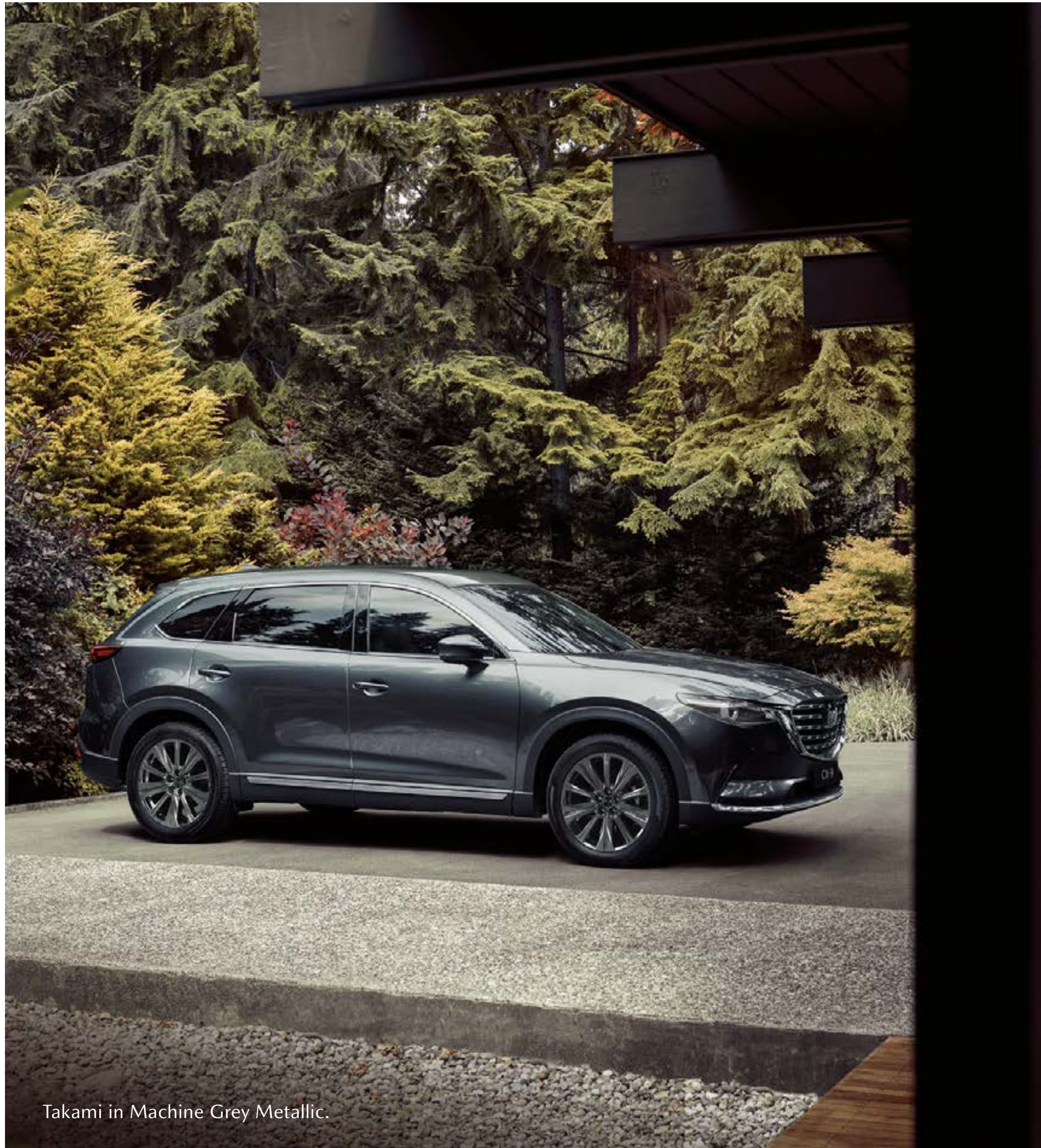
Takami in Machine Grey Metallic.