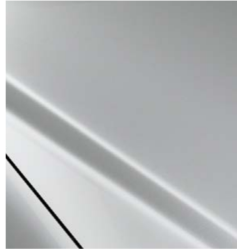
Sonic Silver Metallic