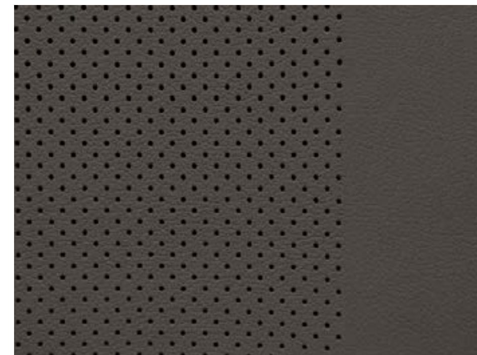
Walnut Brown Nappa Leather# (Takami)