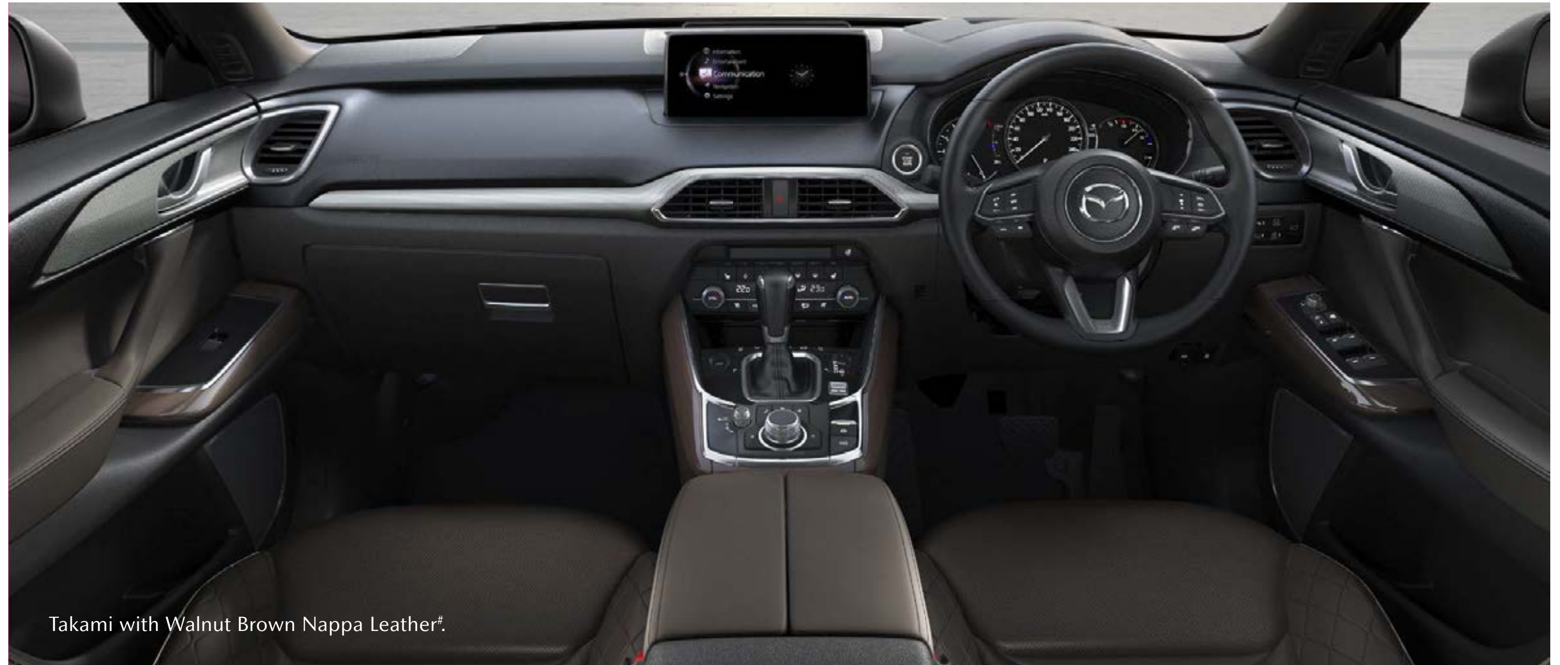
Takami with Walnut Brown Nappa Leather#.

You have a choice of trims in Mazda CX-9, all perfectly complementing the high quality craftsmanship and premium finishes, including wooden accents on the Takami grade.