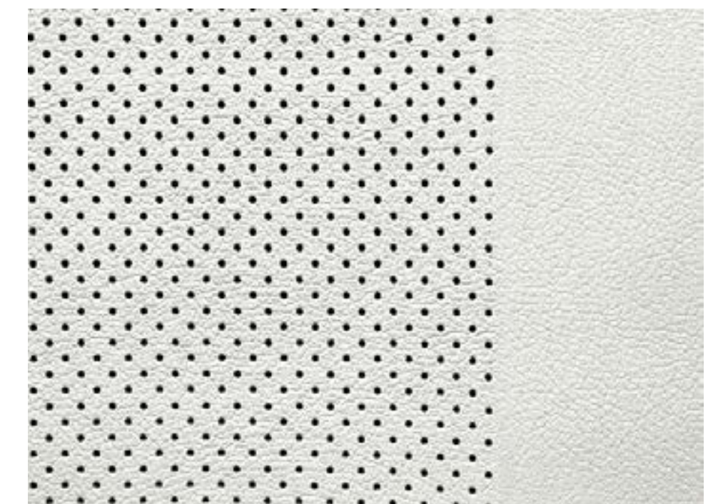
Pure White Nappa Leather# (Takami)