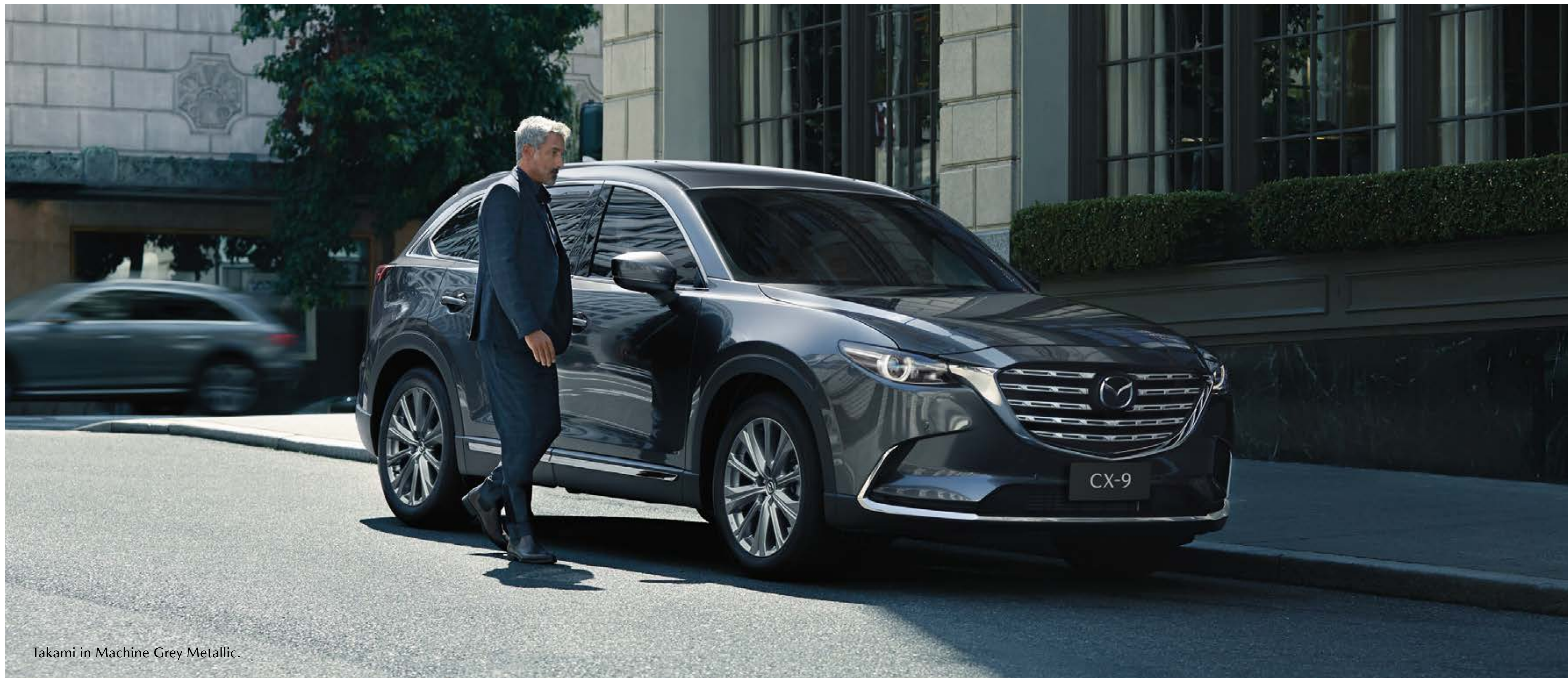
Takami in Machine Grey Metallic.