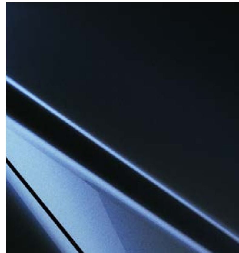
Deep Crystal Blue Mica