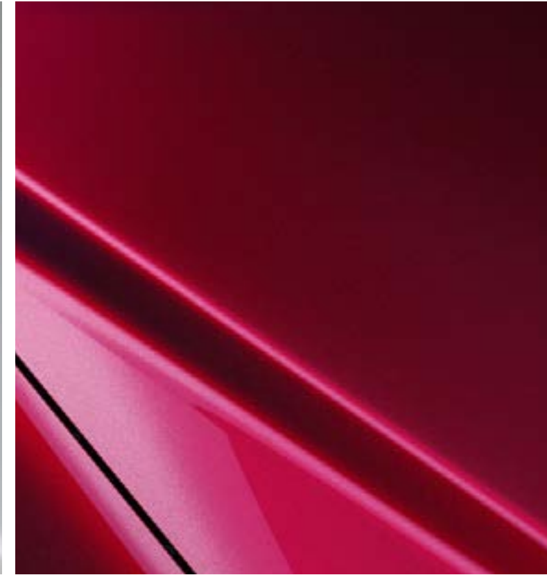
Soul Red Crystal Metallic ^