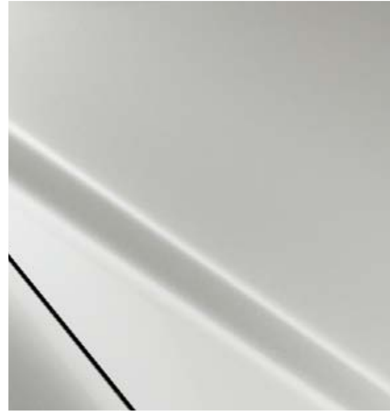
Snowflake White Pearl Mica