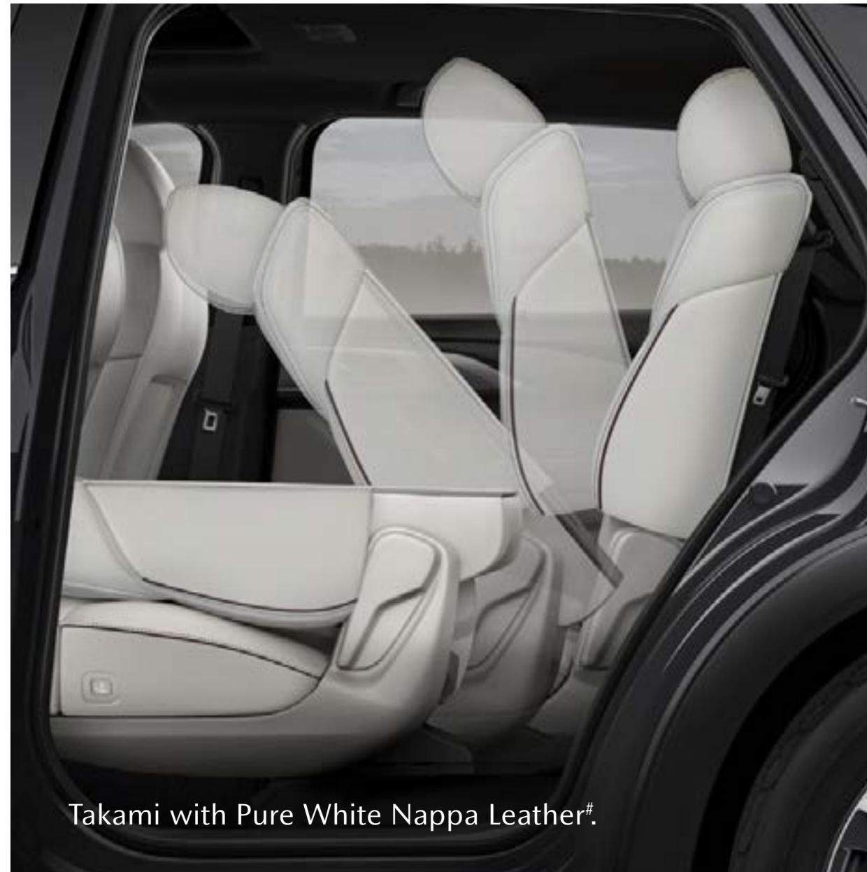
Takami with Pure White Nappa Leather # .