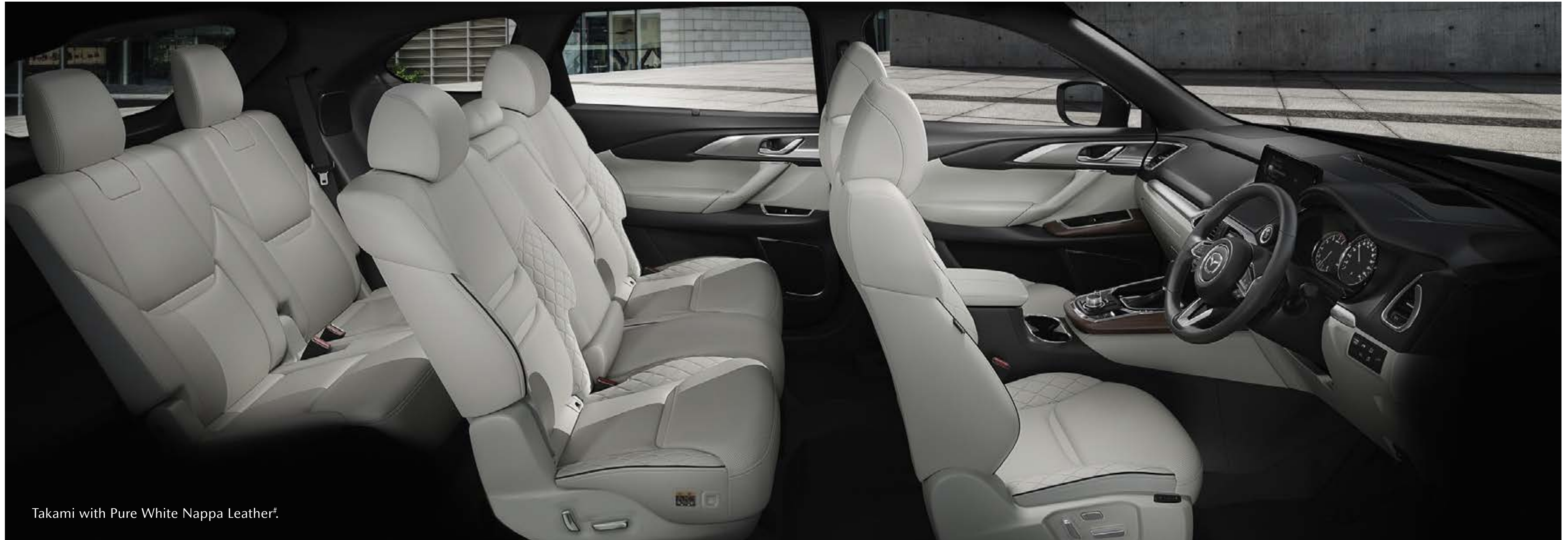
Takami with Pure White Nappa Leather # .