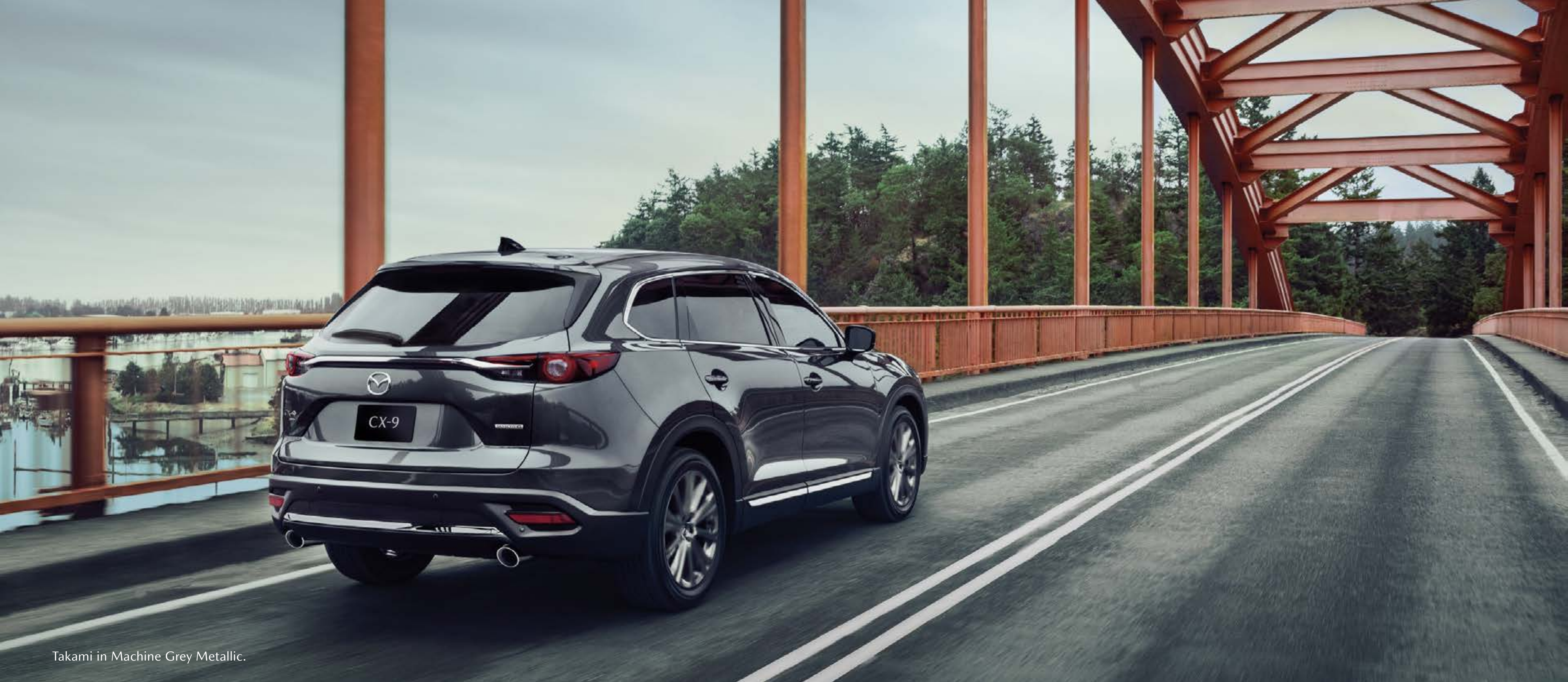
Takami in Machine Grey Metallic.