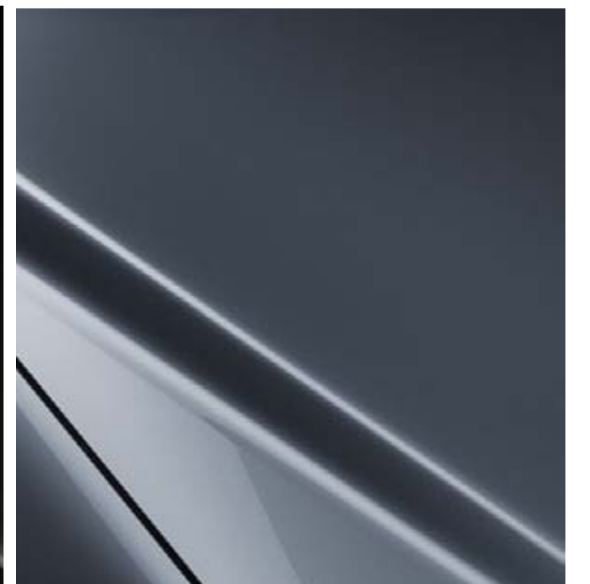
Polymetal Grey Metallic