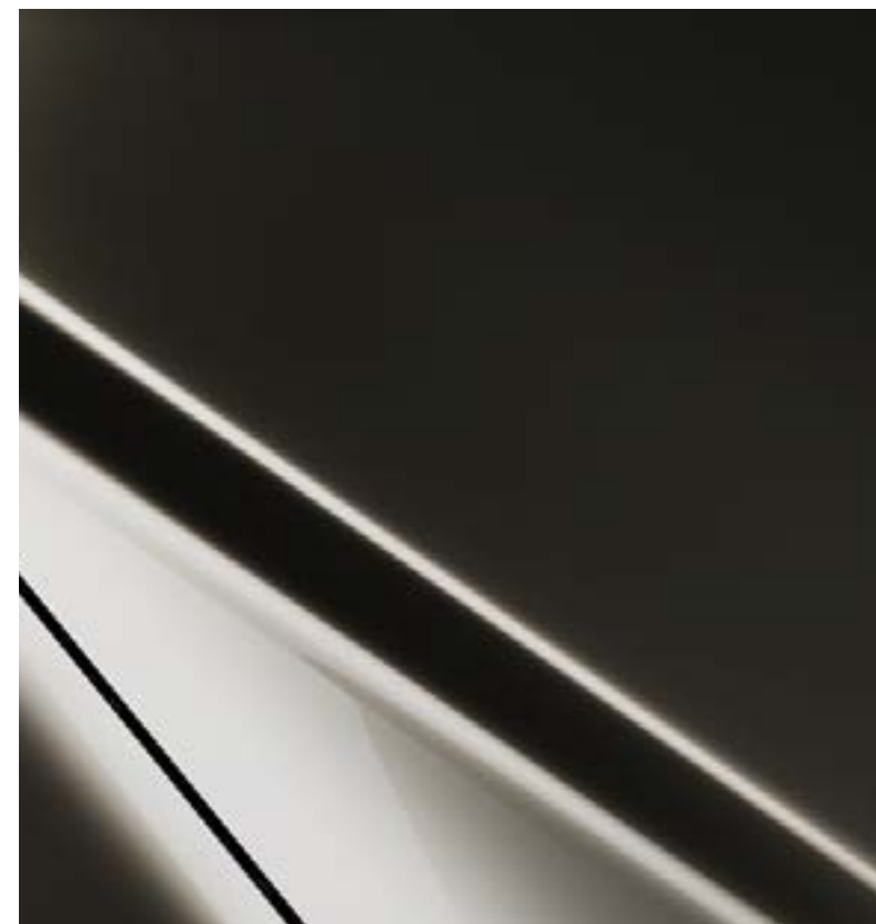
Titanium Flash Mica

Take your pick from the range of colours – all beautifully matched to the bold exterior lines of Mazda CX-9.